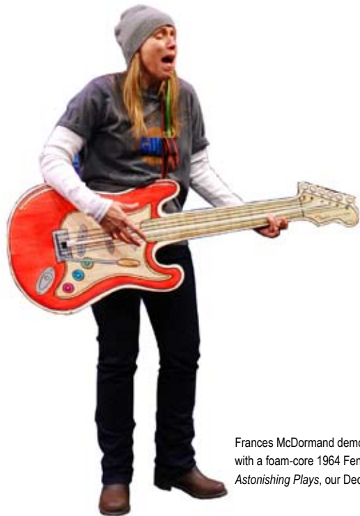
Frances McDormand demonstrates her musical prowess with a foam-core 1964 Fender Stratocaster in Holy Cow! The Astonishing Plays , our December Playmaking show.

NONPROFIT ORG. U.S. POSTAGE PAID NEW YORK, NY PERMIT #4292