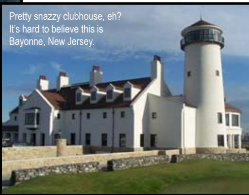
Pretty snazzy clubhouse, eh? It's hard to believe this is Bayonne, New Jersey.