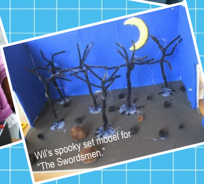
Will's spooky set model for "The Swordsmen."