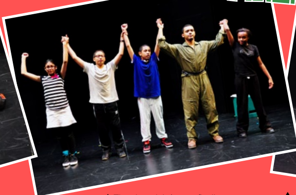
▲ The playwright/actors finally stopped fighting long enough to take a friendly bow.