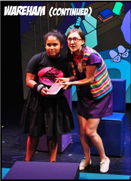
In Darcy Fowler's The Eyes of the Melting Boy , Chyanne Peña and Darcy were two girls who dared to descend into a suburban basement to watch an old, scary movie with the same name as their play.