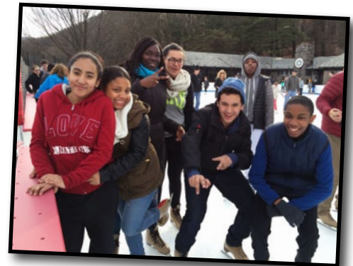
Nyack: The Two-on-Two teen actors took a break from rehearsing by skating at Bear Mountain.