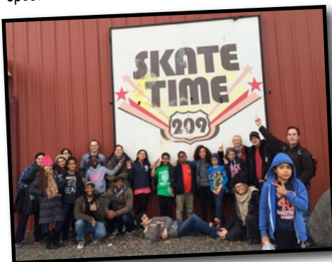
Stone Ridge, NY: Kids and adults alike had a great time at SkateTime...