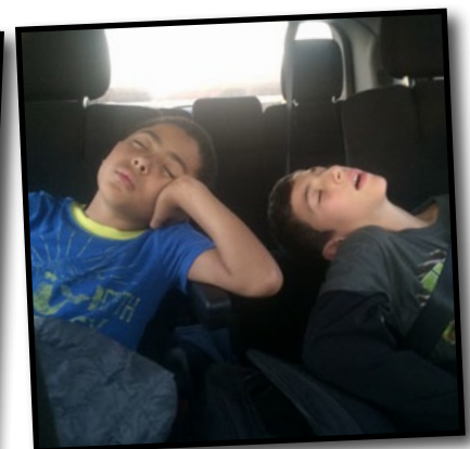
...and you know the weekend was a success when the kids sleep all the way home.