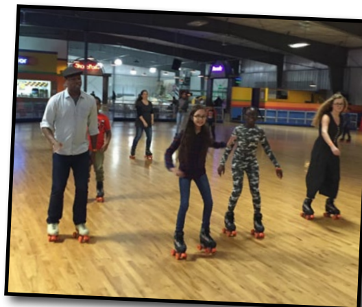
... 'cause that's the way we roll...