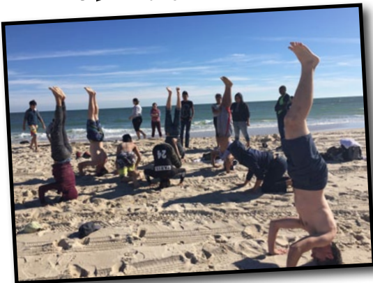
Bridgehampton: The Playback crew found new perspectives on the beach in October...