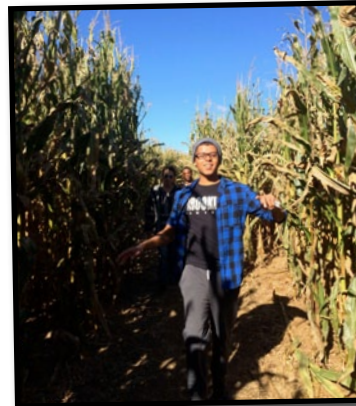
...and almost didn't find their way out of the Maize at Fairview Farm